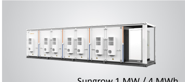
Sungrow 1 MW / 4 MWh