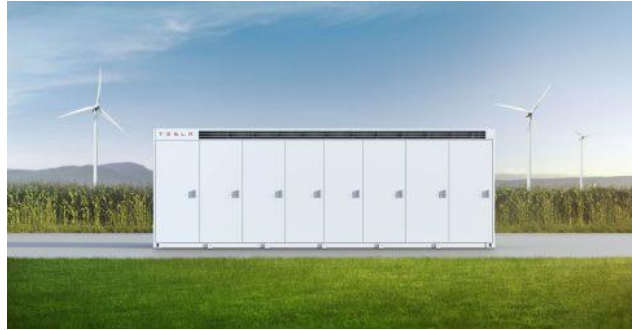
Tesla Megapack 0.7 MW / 3 MWh Tesla Powerpack 50 kW / 232 kWh