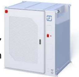
Fluence "Edgestack" Power and Energy Unknown