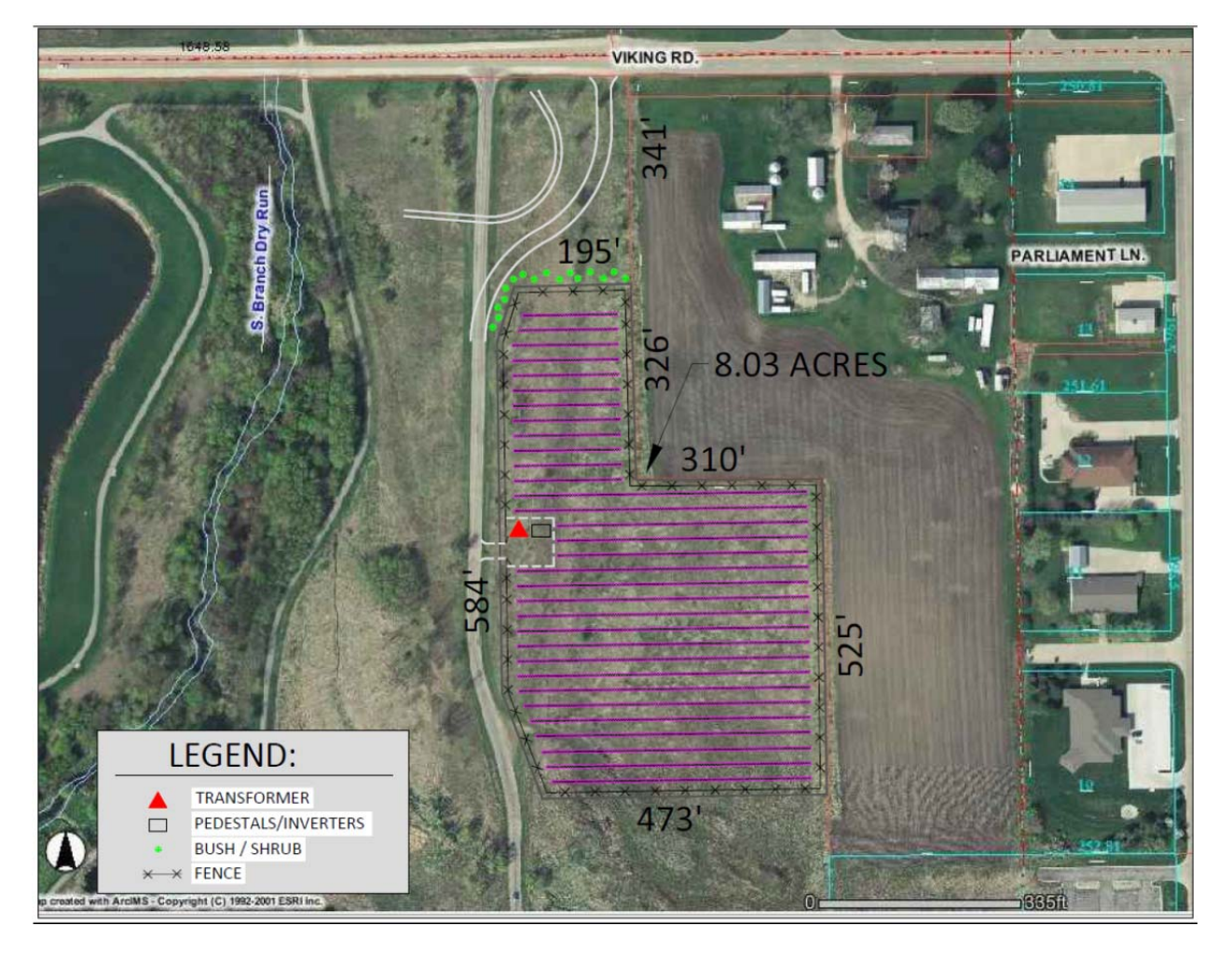
Image from Exhibit 1: Proposed Site Specifics. Note: this image is available as a separate electronic file (Exhibit 1).

The Site is part of the City of Cedar Falls Prairie Lakes Park. The aerial photo, complete with multiple layers is also provided as a separate .pdf file called Exhibit 1. The access road and bicycle trail have changed since the time this satellite image of the area was collected; these changes are reflected by the solid white lines to the north of the Site. An additional photo with topographical data superimposed is further below. The topographical data is from an aerial survey of the City of Cedar Falls that was conducted in 2010.